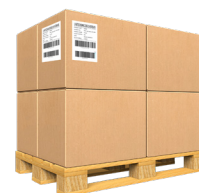
APL 60s 2 LABELS 3 pallets/min*

Due to our continuous improvement policy, our product specifications are subject to change without notice.