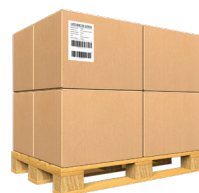
APL 60s 1 LABEL 10 pallets/min*